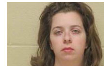
Bossier Booking Mugs May 31