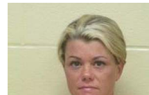
Bossier Booking Mugs June 1-3